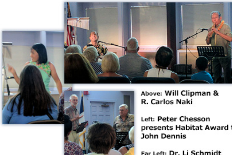
Above: Will Clipman & R. Carlos Naki